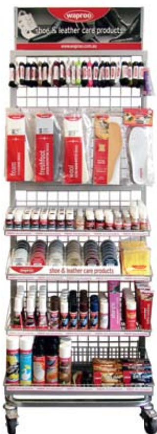
Heavy Duty Wire Merchandising Stand

Height: 1835mm Width: 665mm Depth: 400mm