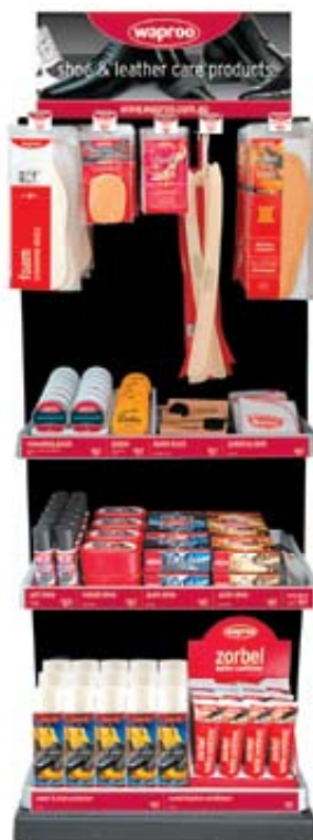
M1 Display Stand

Height: 1835mm Width: 665mm Depth: 400mm