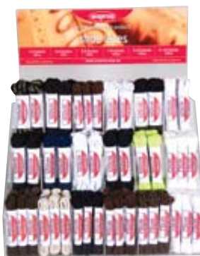
Shoe Laces Counter Display Stand