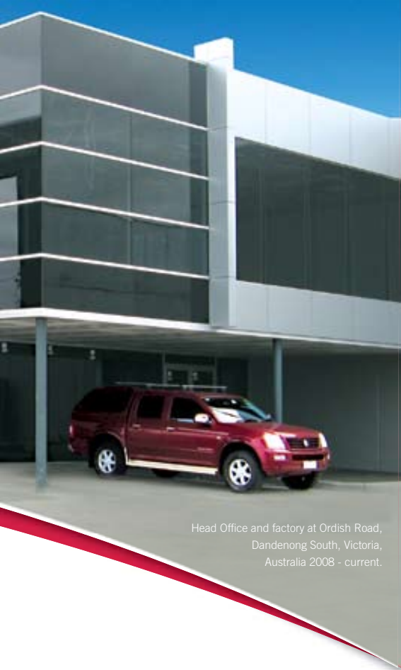
Head Office and factory at Ordish Road, Dandenong South, Victoria, Australia 2008 - current.

Waproo is immensely proud to be an Australian family owned business that continues to manufacture and supply exceptional quality shoe and leather care products.