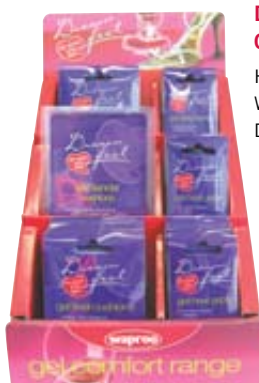
Dreamfeet Counter Display

Height: 1750mm Width: 640mm Depth: 400mm